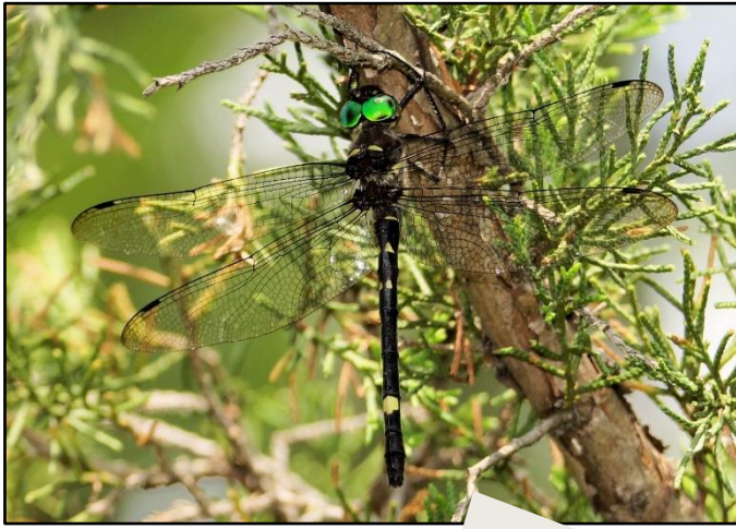
Swift RC, Female, abdomen detail, Montgomery Co, Aug 6, 2021, Jim Lemon. Note large spot on S7.