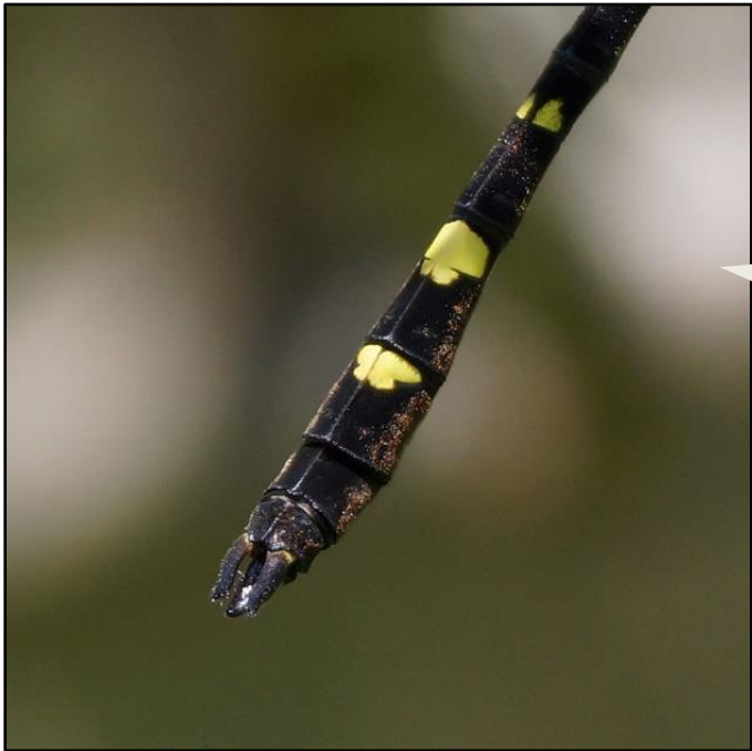
Macromia Hybrid, Male, abdomen detail, Darke Co, Jul 29, 2017. Note "moth marking" on S8. Jim Lemon.