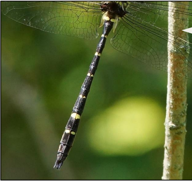
Royal RC, Male, abdomen detail, Putnam Co, Jul 25, 2019, Jim Lemon. Note large size, lack of club, smaller markings.