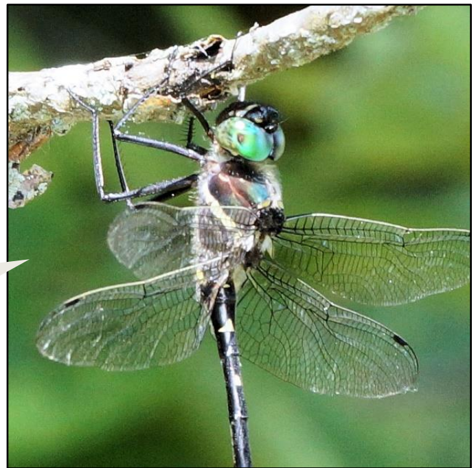
Swift RC, Male, thorax detail, Lucas Co, Aug 8, 2019, Jim Lemon.