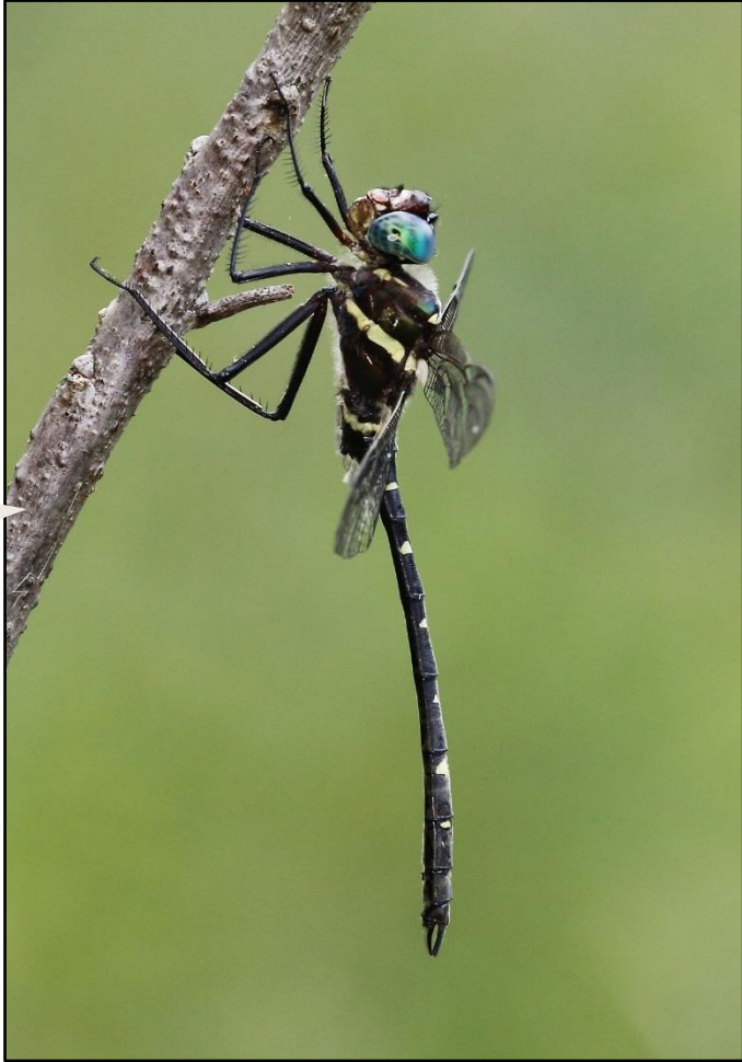
Royal RC, Male, lateral, Lucas Co, Aug 17, 2021