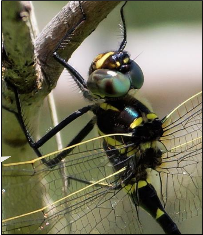
Macromia Hybrid, Male, thoracic detail, Darke Co, Jul 29, 2017. Jim Lemon.