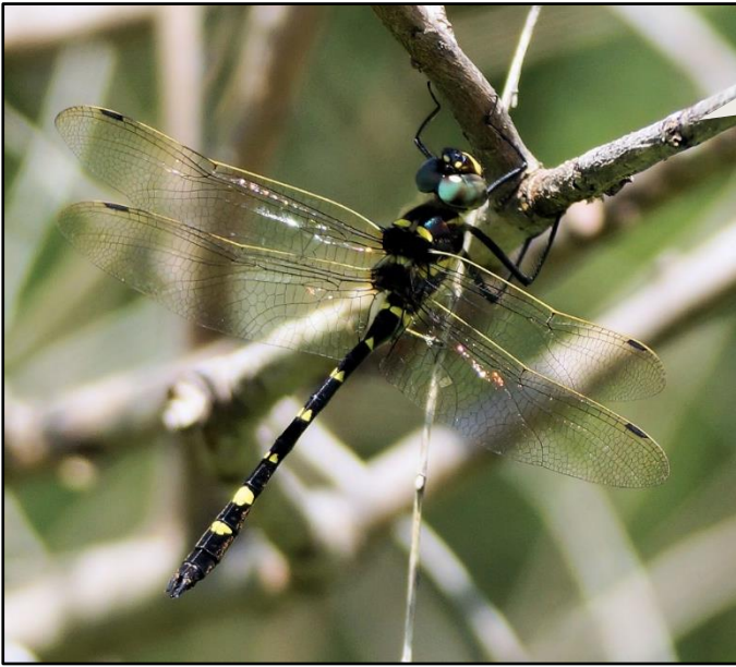
Macromia Hybrid, Male, Darke Co, Jul 29, 2017, Jim Lemon.