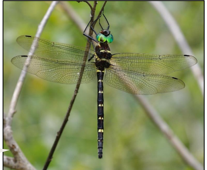
Royal RC, Female, Lucas Co, Aug 10, 2022, Rick Nirschl.

Macromia Hybrid Macromia taeniolata x pacifica is what we're currently calling the RCs that fall in between field marks of Royal and Gilded. Western Ohio is apparently the center of this phenomena, although we now have a couple eastern counties in the mix. We see Hybrid individuals that are marked differently from Royal and Gilded, and are also in between on size. In most locations where Gilded flies, there are Royals (but not all). There is a case to be made that these in-between RCs are a separate Ohio species, the Wabash River Cruiser Macromia wabashensis . So far, not every county with Hybrids has records of Gilded, which, of course, would be a requirement for a hybrid. Further, we have pairs in wheel that appear to both be Hybrids (Does mating imply viability?). So, there are questions, and maybe speciation right in front of our eyes, or something we're still working out. The key field mark for these RCs is the pattern of the spot on S8 – shaped like the profile of a moth.