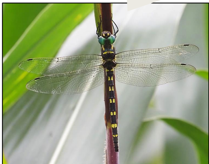
Gilded RC, Female, lateral, Logan Co, Aug 11, 2022, Jim Lemon. Note large yellow spots S3-7.