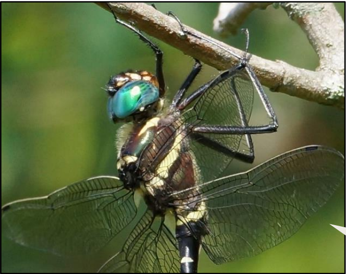
Royal RC, Male, thoracic detail, Putnam Co, Jul 25, 2019, Jim Lemon.