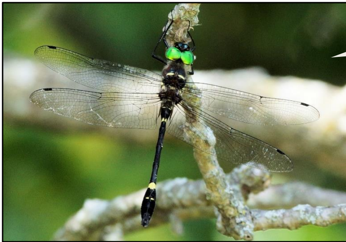
Swift RC, Male, Lucas Co, Aug 8, 2019, Jim Lemon.

The infrequently observed Allegheny RC Macromia alleghaniensis is most similar to Swift, and so mentioned here. Allegheny is slightly smaller than Swift and has a complete yellow ring on abdominal segment 7. Observers in the southern counties should be on the lookout for Allegheny. (No photos).