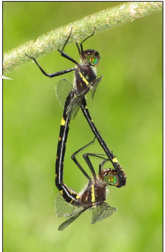
Swift RC, Female, thorax detail, Montgomery Co, Aug 6, 2021, Jim Lemon.