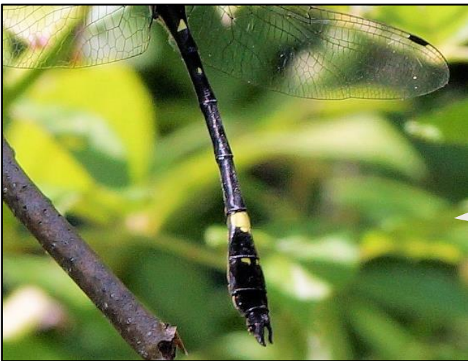
Swift RC, Male, abdomen detail, Lucas Co, Aug 8, 2019, Jim Lemon. Note club.