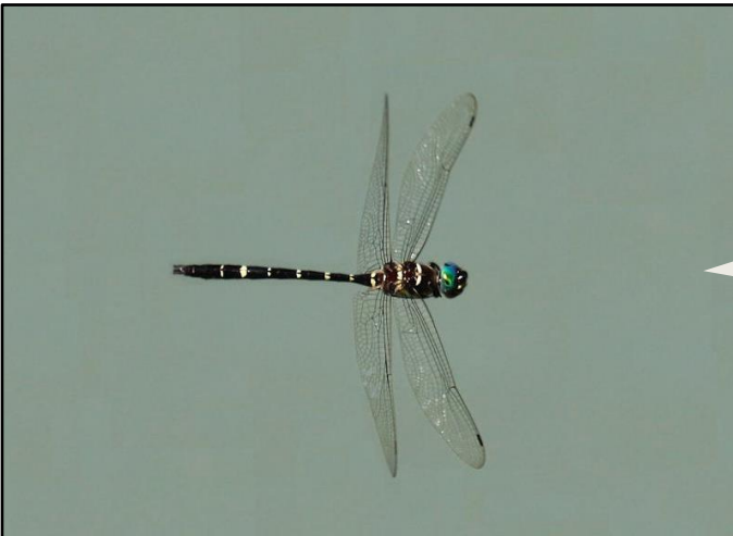
Royal RC, Male, Dorsal, Lucas Co, Aug 24, 2022, Rick Nirschl.

Following are species descriptions. As with earlier ID segments, these photos are the best examples of individual type. Not everything appears so close to type. As already mentioned, there is considered to be a hybrid, which is given treatment here. I'll note as well that there are many photos (200+) awaiting ID because it's not clear where they fit. This is one of the higher percentages of genera waiting on ID.