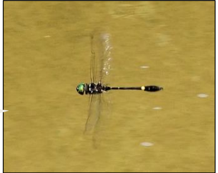
Swift RC, Male, Dorsal, Butler Co, Jul 25, 2019