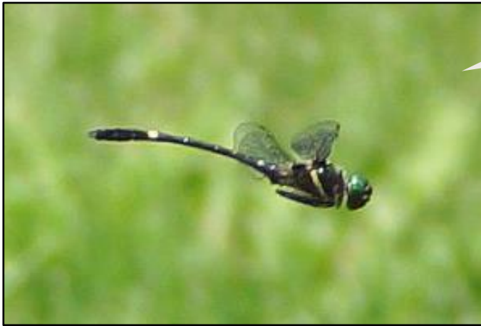
Swift RC, Lateral, Darke Co, Jul 22, 2021, Jim Lemon.

Let's start with some aerial shots – this is how we usually see Macromia , but when we manage a shot, there is, generally, a lot more blur than bug.