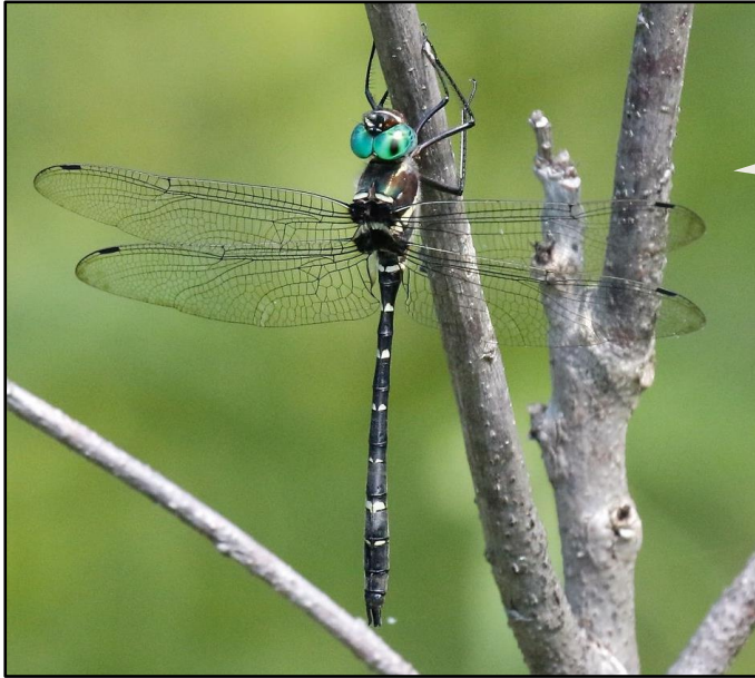
Royal RC, Male, Putnam Co, Jul 25, 2019, Jim Lemon.

Royal River Cruiser Macromia taeniolata is our largest Macromia. Markings are small and Royal looks black in flight. Long slender wings, long abdomen. With the right sun angle, eyes are emerald green, but also frequently look dark. Royal abdomen is trim without the clubbing seen in Swift. Royal flies in July and August, probably statewide. Seemingly fearless, I've had them fly by within a foot or two – an impressive sight.