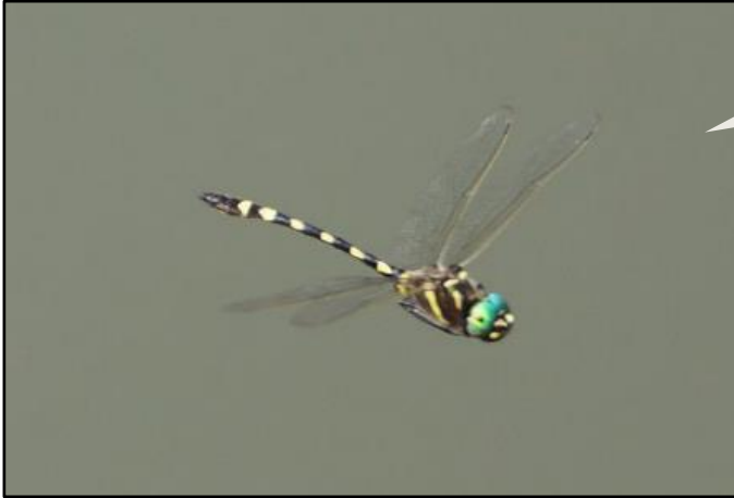
Gilded RC, Lateral, Darke Co, Jul 17, 2020, Jim Lemon.