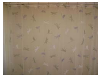
Dragonfly Shower Curtain