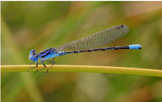
Argia alberta