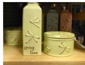
Vase & Jars