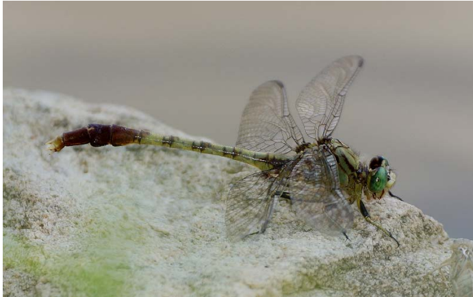
Arigomphus submedianus