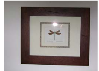
Matted Print II