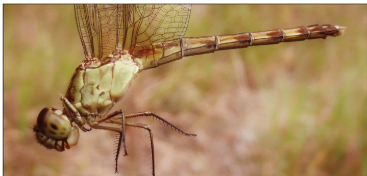
Mature female Band-winged Dragonlet, 6 October 2014, Point Pelee National Park.

I had a tripped planned to Point Pelee from 3-6 October and I was excited about the possibility of seeing Band-winged Dragonlet. As per several other occasions with stray insects; if there is one there may be more. Despite poor insect weather over the four days I was at Point Pelee, I was lucky and managed to see a dragonlet on 6 October. An excerpt from my Ont-Odes post is as follows: