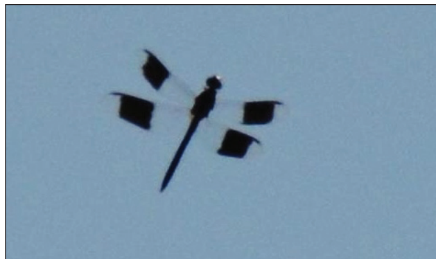
Flight shot of mature male Band-winged Dragonlet at Tip of Point Pelee National Park, 29 September 2014 - photo Lev Frid.

“At the Tip, I photographed an unusual dragonfly that came in with a small passage of Monarchs and Sharp-