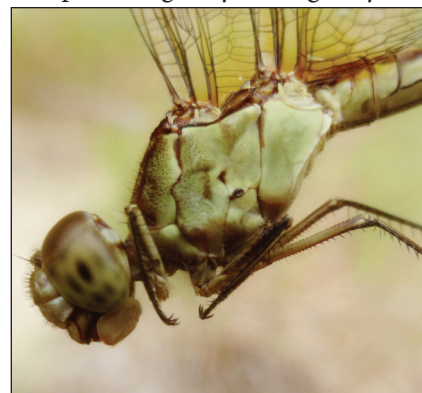
Close-up of thorax of female Band-winged Dragonlet, Point Pelee National Park, 6 October 2014- photo Bill Lamond.

Meadowhawks and one female Mottled Darner. At one point I noticed a smallish pale dragonfly in a grassy area that initially looked uninteresting. I must have been thinking female Blue Dasher or Eastern Pondhawk but I netted it as I was curious. On examining this dragonfly it was obviously not a Dasher but resembled a very washed-out female Pondhawk, although I have never seen any