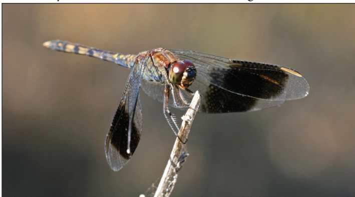
“A tropical dragonfly in Canada” - an immature male Band-winged Dragonlet, 17 September 2008, Point Pelee National Park - photo Steve Pike.

This species was first found far to the north of its usual haunts in 1934, when there were three records: Gibson County, Indiana, 1 September; Pike County, Indiana, 1 September; and Urbana, Ohio, 11 June. This species was not recorded again “in the north” until 11 August 2006, when an individual was photographed near Cincinnati, Ohio. The following year, this species was again found in Ohio, at four sites in three counties in the northeastern part of the state (Lake, Cuyahoga, and Geauga), with multiple individuals at three of the four sites (from 27 August to 17 October). At one site (Leroy Township, Lake County), a population consisting of about 25 immatures, females, and males, was discovered indicating that this species had successfully bred. In fact, the species had likely bred successfully at three of the four sites. Truly astounding for such a far-flung dragonfly. Also in 2007, this species was found in extreme southeast Wayne County, Michigan, at the Detroit River International Wildlife Refuge (Humbug Marsh Unit) on 6 October – the most northerly record at that time. This location is only about five km away from Boblo Island, Amherstburg, Ontario.