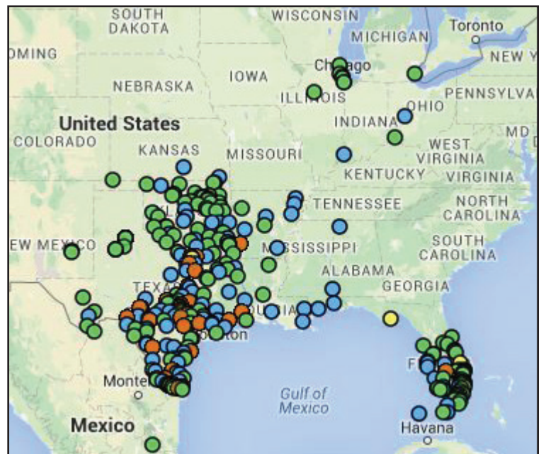
Map of submitted records of Band-winged Dragonlet from www.odonatacentral.org . Differing colours are from different sources. Not all records have been submitted. Note records lacking from Northeast Ohio.

In 2012 there were four sightings of dragonlets in the north, all in Illinois. There were three records from Cook County, ranging from 20 May to 5 June, and a record on 20 May from Lake County, which is about two km south of the Wisconsin border – the most northerly record to date. Both of these counties border Lake Michigan, and indeed all of these four 2012 records were within one km of Lake Michigan, a known pattern, as stray insects are often found adjacent to large bodies of water. In 2014