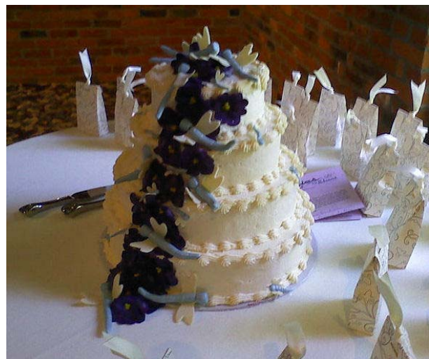
Cool Cake !