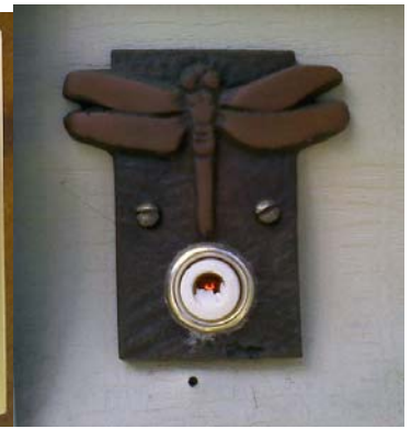
Door Bell Cover

This section is intended to be a member driven / contribution section. Where in your everyday life are odonates a part of ? Take a photo, send in a comment, make a comment, tell us where to get good Odonata “things”. Send your examples, comments, contributions, photos, etc to editor Steve Chordas III at ( stevehordas@sbcglobal.net ) or snail mail at 1063 West 2 nd Avenue, Grandview Heights, Ohio 43212.