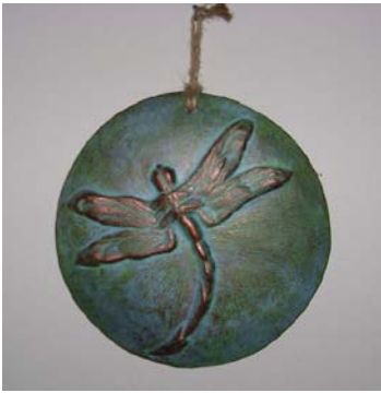
Ceramic Wall Hanging

- Next time you swing & miss, don't feel bad..think about the frog ! Watch the video, you'll see !!