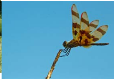
Halloween Pennant. Kibby Rd Park area, Cinn. 9/26/2011. RCG PennantHalloween0066