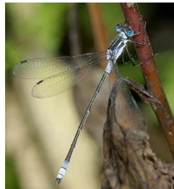
Figure 2. Lestes disjunctus australis