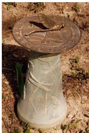
Dragonfly sundial purchased from internet. Stand purchased from Roush Hardware Westerville Ohio