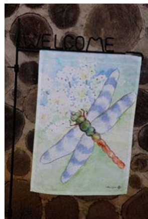
Comet Darner yard flag purchased at the Steam Thresher's Show