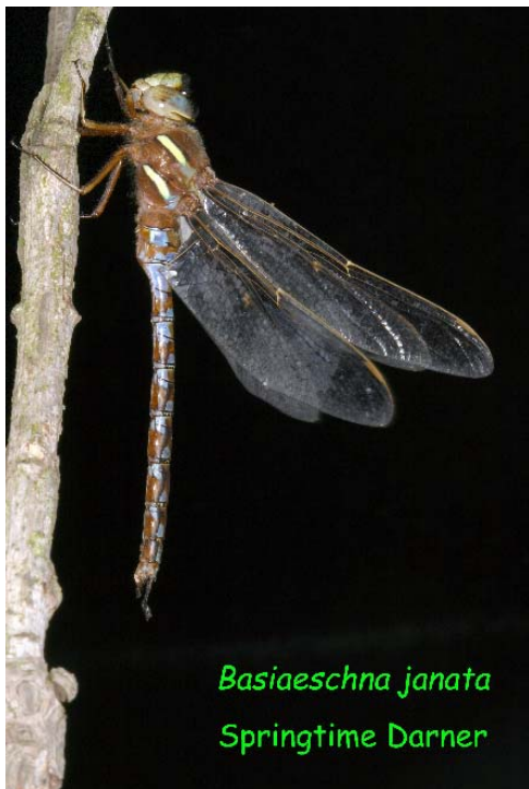
Basiaeschna janata Springtime Darner

Photo of Basiaeschna janata from the OOS website image bank.