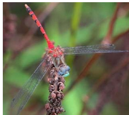
Figure 3. Sympetrum ambiguum