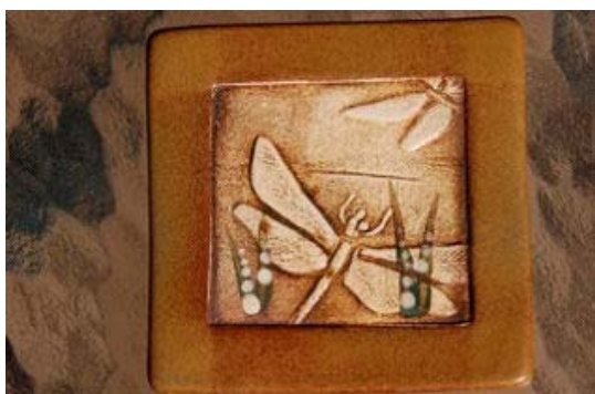
Hand-made glazed clay tile made by Otis Pottery East Jordan, Michigan

* Thanks for the 2 responses to this request thus far.