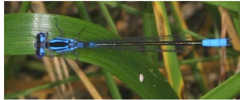
Figure 1. Enallagma aspersum