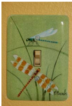
Light switch plate from a dollar store