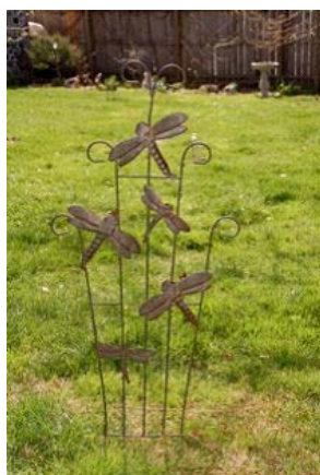
Metal dragonfly yard ornament. Found in old garage, origin unknown

This section of the newsletter is intended to be a member driven / member contribution section. Where in your everyday life (i.e. your home, car, work, hobbies, etc) do odonates occur or are part of ?