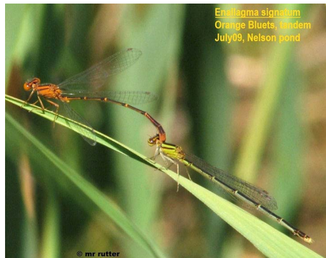
Figure 1. Enallagma signatum