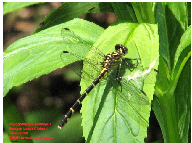
Figure 3. Stylogomphus albistylus

Blue Dasher- Pachydiplax longipennis 10Jun-21Aug 24 Eastern Amberwing- Perithemis tenera 26Jun-25Aug 5 Wandering Glider- Pantala flavescens 21Jun-21Aug 3 Ruby Meadowhawk- Sympetrum rubicundulum 10Jun-4Sep 35 Autumn Meadowhawk- Sympetrum vicinum 6Aug-9Nov 31 Band-winged Meadowhawk- Sympetrum semicinctum 7Jul-22Sep 13 White-faced Meadowhawk- Sympetrum obtrusum 20Sep-27Sep 6 Black Saddlebags- Tramea lacerata 9Jun-23Sep 16