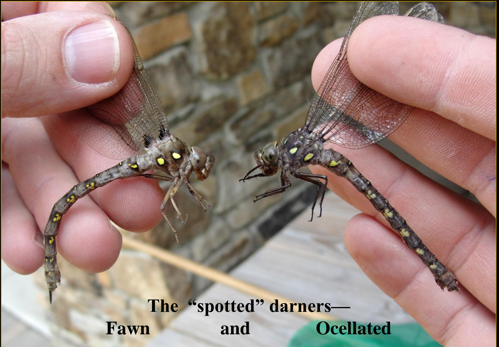
The “spotted” darners— Fawn and Ocellated