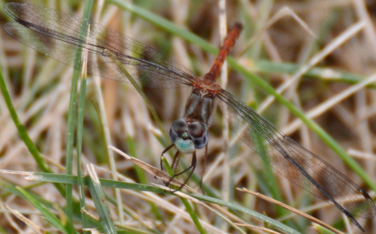
Blue-faced Meadowhawk Sympetrum ambiguum